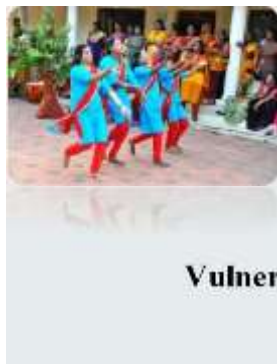
Art & Theatre groups