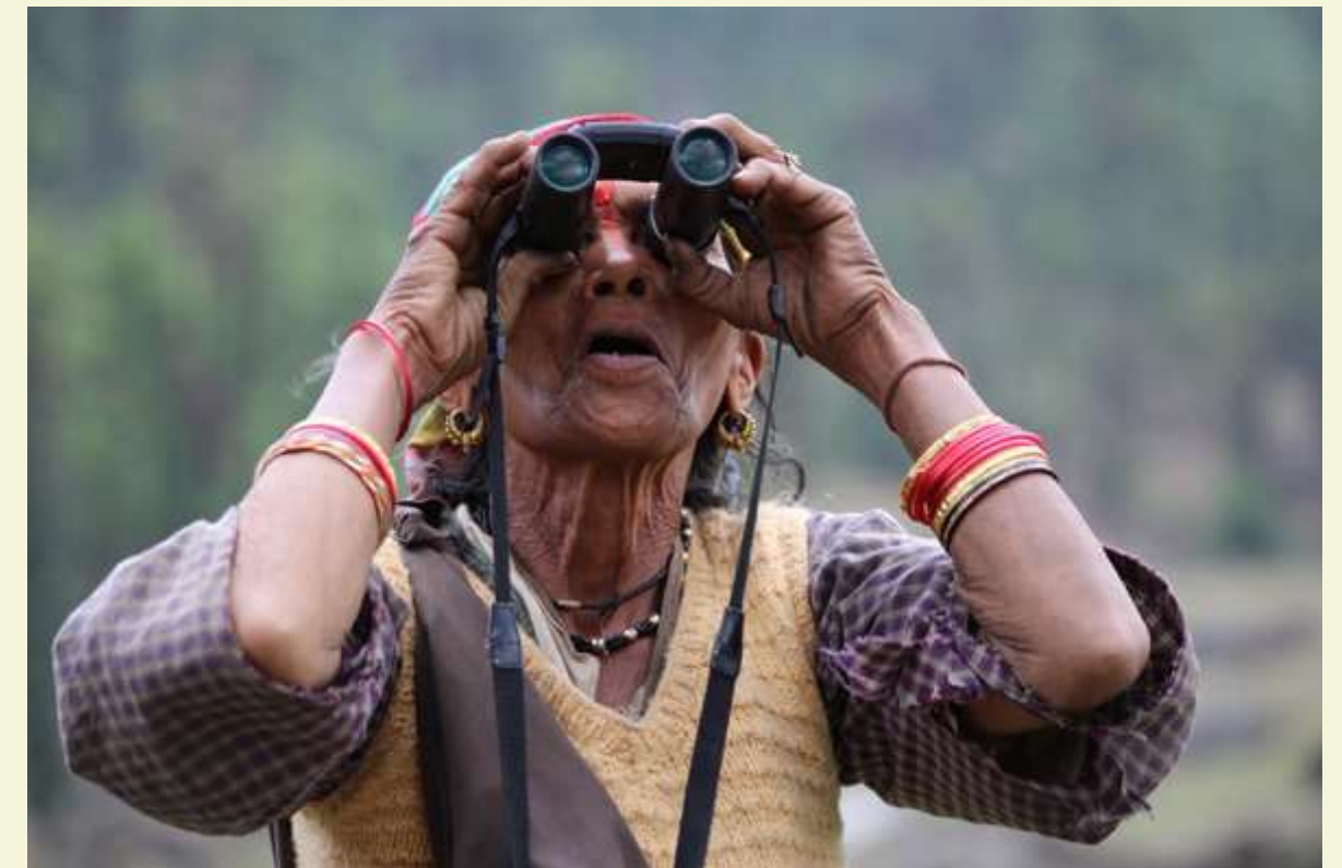
Rebuilding pride in their culture and raised awareness about the natural resources and importance of conservation