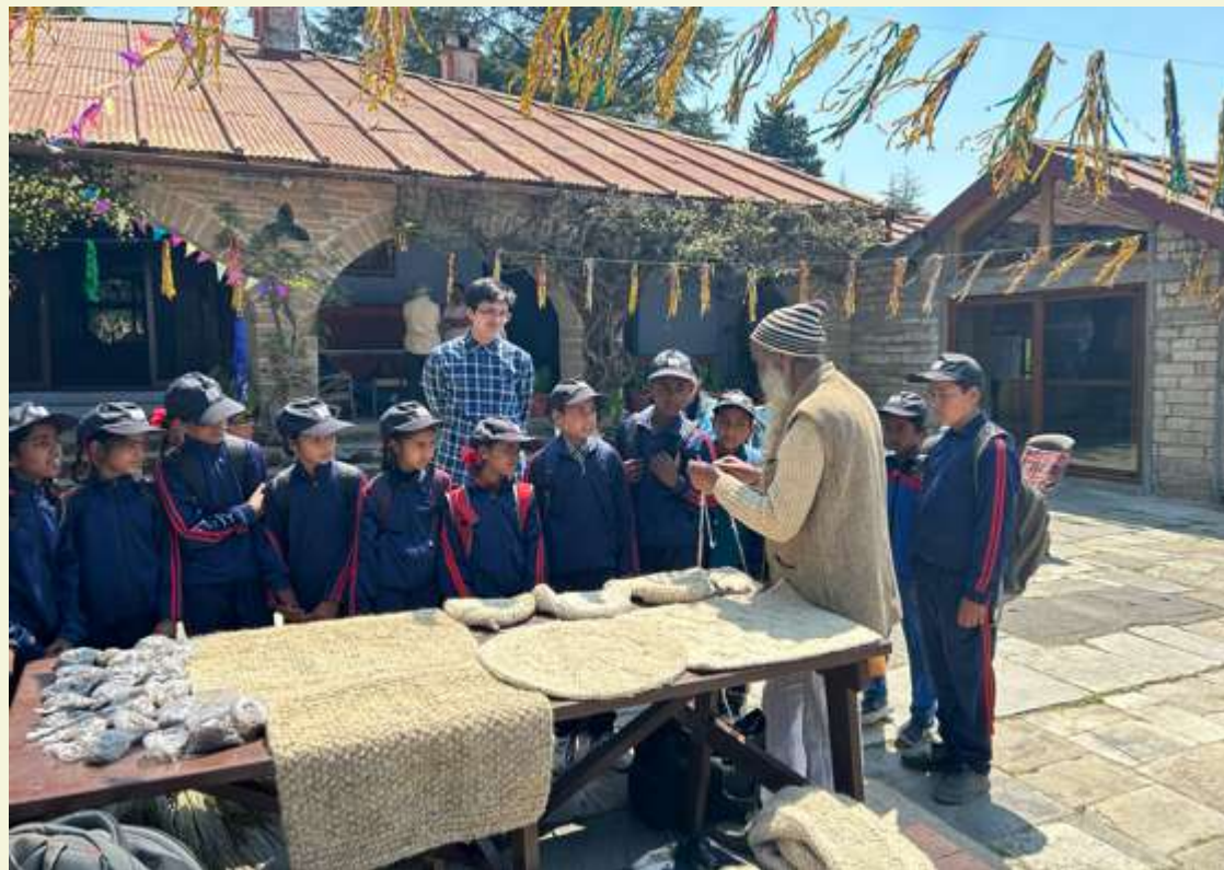
Pictured: Students of Bhetuli Primary School learning more about how the communities in Upper Saryu Valley make use of sheep wool.