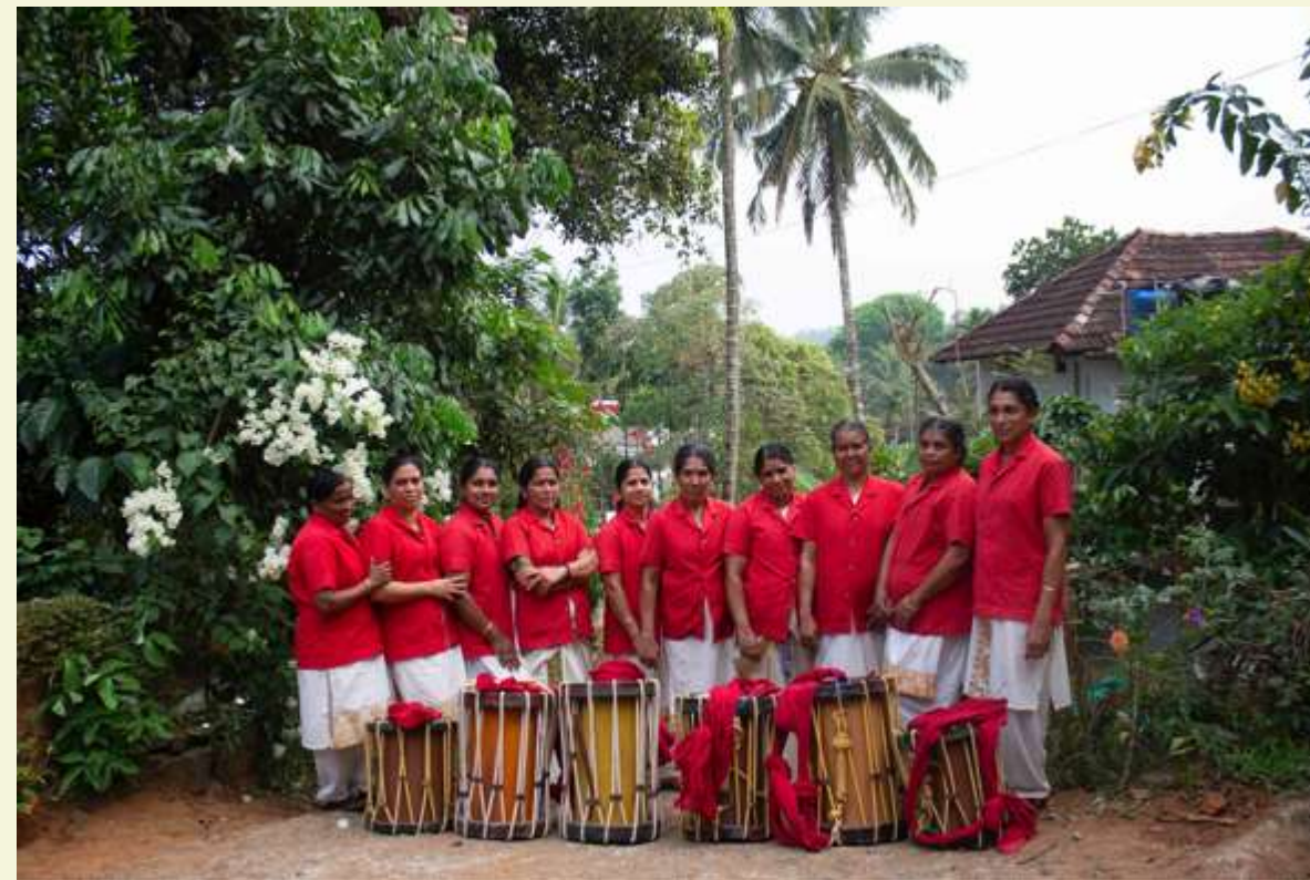
An all-women drumming group in Mothakkara, Kerala